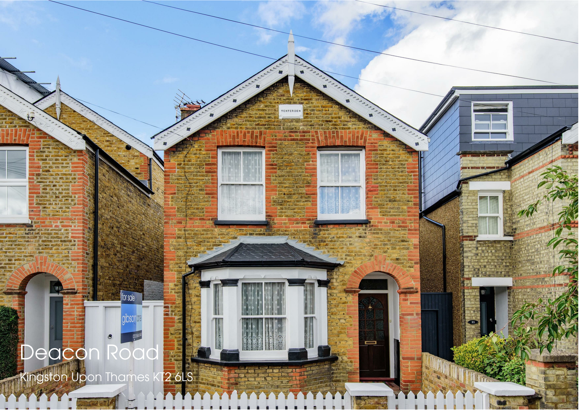
Deacon Road Kingston Upon Thames KT2 6LS